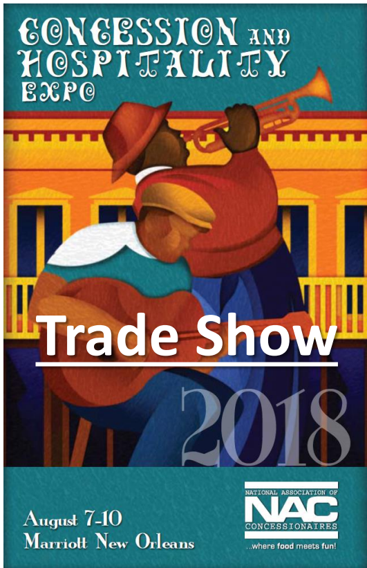
Exhibit at THE International Concessions and Hospitality Marketplace