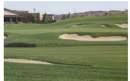
Don't miss your chance to play at the beautiful Anthem Country Club.